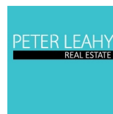
Rental Department 03 9350 5588