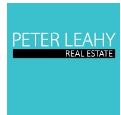
Rental Department 03 9350 5588