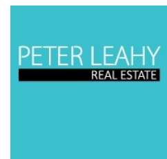
Rental Department 03 9350 5588