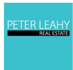
Rental Department 03 9350 5588