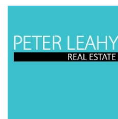
Rental Department 03 9350 5588