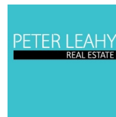
Rental Department 03 9350 5588