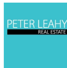
Rental Department 03 9350 5588