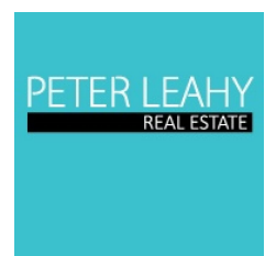
Rental Department 03 9350 5588