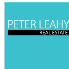
Rental Department 03 9350 5588