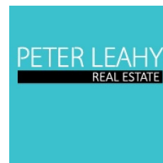
Rental Department 03 9350 5588