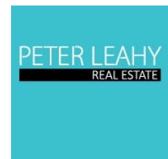
Rental Department 03 9350 5588