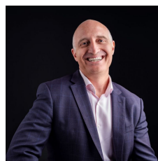
Peter Leahy 03 9350 5588

View : https://www.peterleahy.com.au/sale/vic/north/brunswick/residential/townhouse/7434992