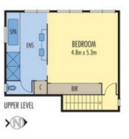
Disclaimer: Please note plans are indicative only and not drawn to exact scale. All dimensions are approximate. Potential buyers should satisfy themselves of any pertinent matters.